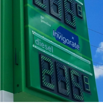
Getting it done right the first time, Keeps you for a lifetime.